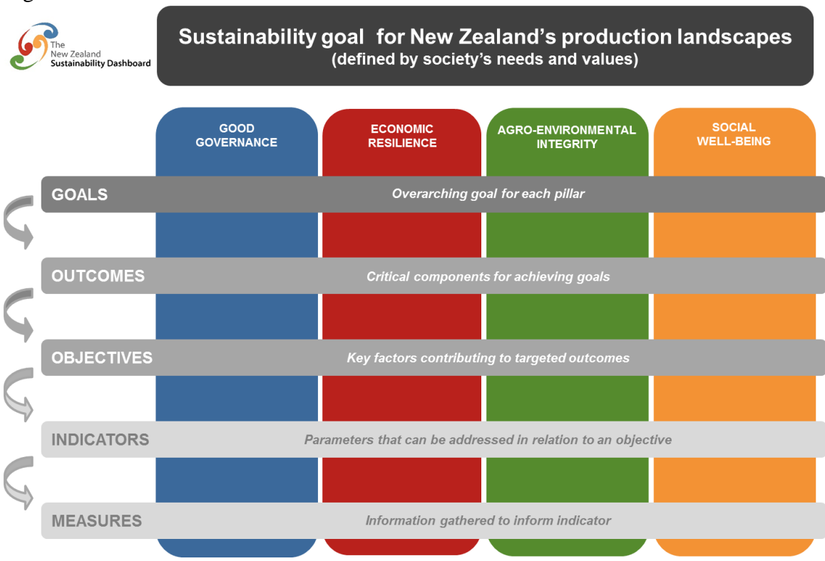
Figure 1: Outline of NZSD framework structure.

environmental Integrity and Social Well-being. This closely mirrors the main sustainability dimensions identified by FAO's Sustainability Assessment of Food and Agriculture Systems (SAFA) (FAO, 2014). Within each pillar is a hierarchy of five levels. The first describes the goal for the pillar, which is broken into the outcomes if that goal is achieved. Each outcome is further divided into objectives, or the intent of these outcomes. The achievement or movement towards the objectives will be shown using indicators and measures (Hunt, 2014). This framework is summarised in Figure 1 with an example of the outcomes, objectives and indicators within a pillar, the social well-being one, shown in Figure 2. Within each of the sectors participating in the NZSD project, the framework elements are being developed by each end-user in consultation with the project team and other stakeholders. The NZSD framework is being used to inform that.